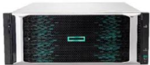
HPE Primera 600 (4-Node Storage Base)