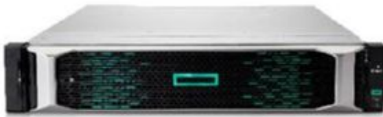
HPE Primera 600 (2-Node Storage Base)

For the latest information on supported operating systems refer to Single Point of Connectivity Knowledge for HPE Storage Products (SPOCK): http://www.hpe.com/storage/spock .